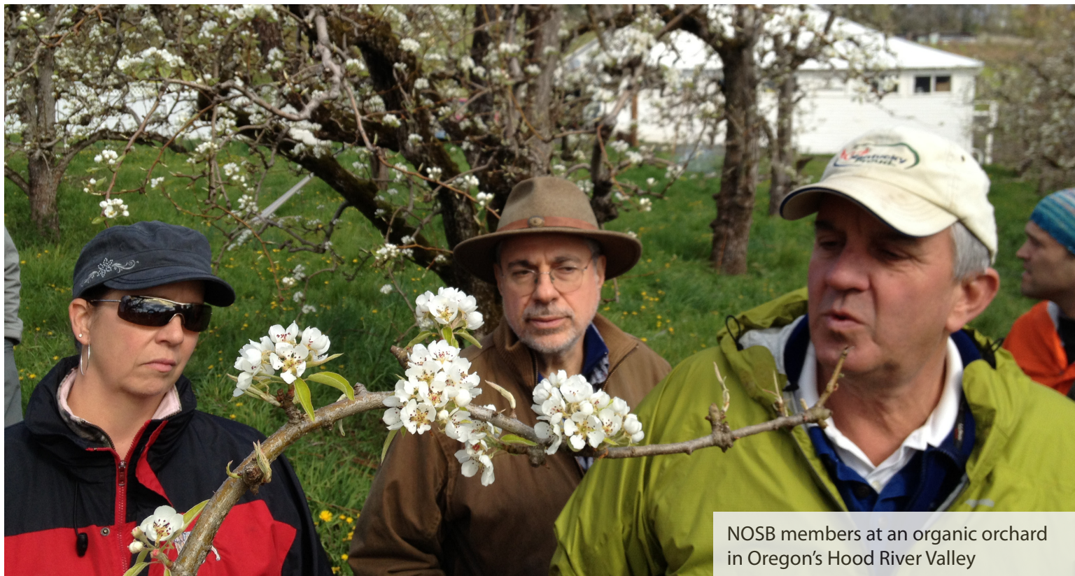
NOSB members at an organic orchard in Oregon's Hood River Valley