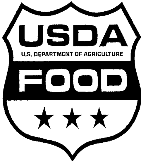
Exhibit 3 Sample Alternative Label for Shipping Containers