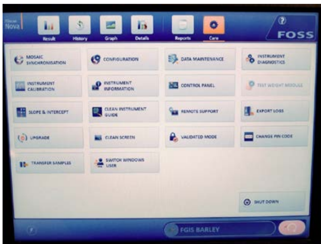
Figure 1. FOSS Nova display showing the Care menu options.

A larger sample size is required for testing purposes. The minimum size is 650 grams for barley and wheat, and 825 grams for corn and soybeans.