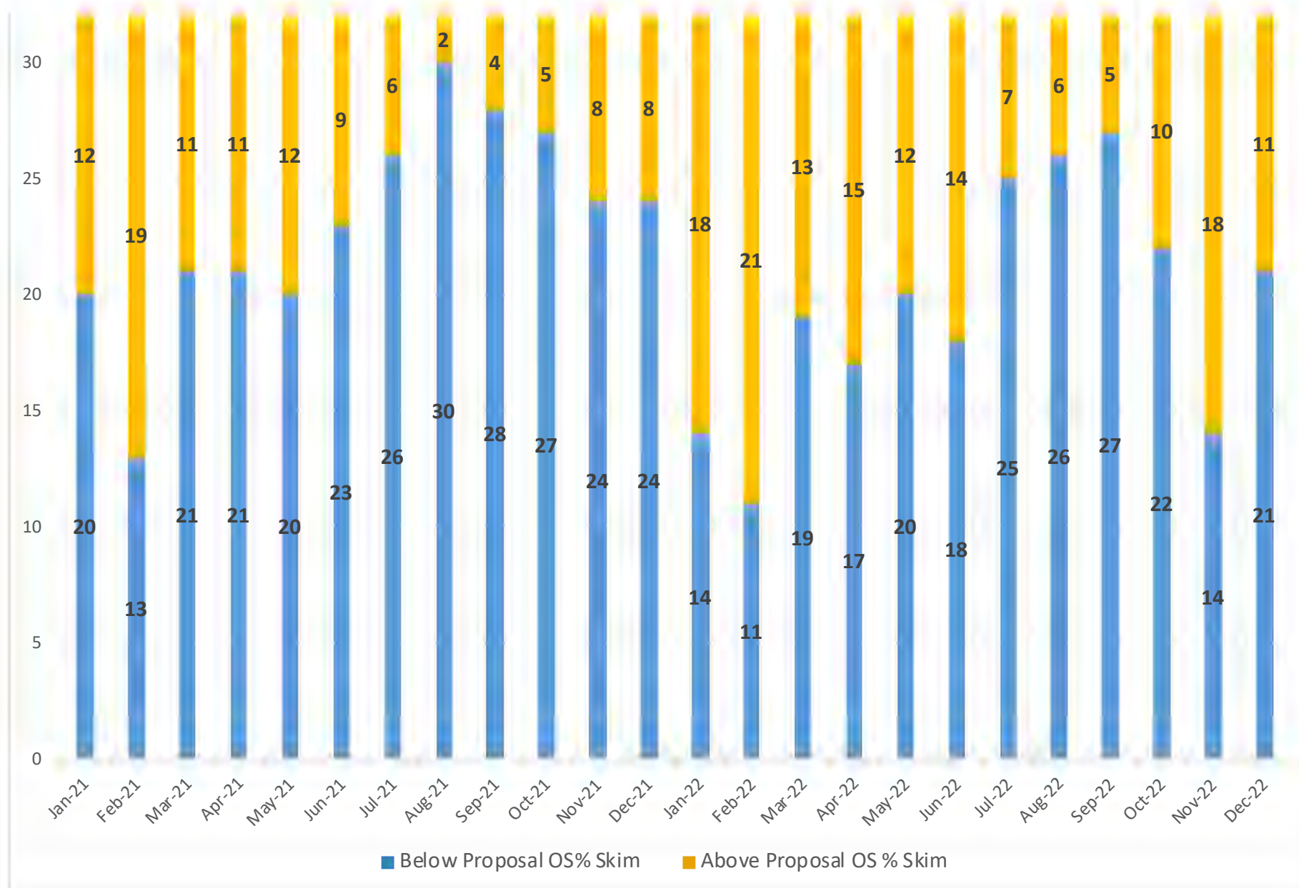
Survey Plants Above & Below Proposal by Month: Other Solids