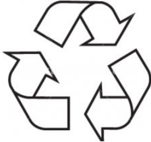
EXHIBIT 3 “Please Recycle” Symbol and Statement