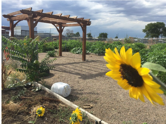
Community Garden at LiveWell/Focus Points Center in GES, managed by Denver Urban Gardens.

Vision. See Appendix H, for a copy of the December 2016 draft of the Denver Food Vision made available for public comment.