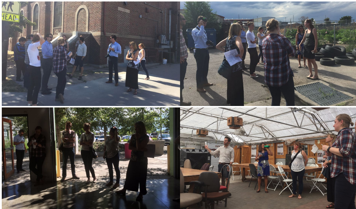
Upper left, 44th and Lincoln (potential location of future school/community garden); upper right, community garden adjacent to Focus Points Community Center; lower left, GrowHaus; lower right, COMAL Heritage Food Incubator.