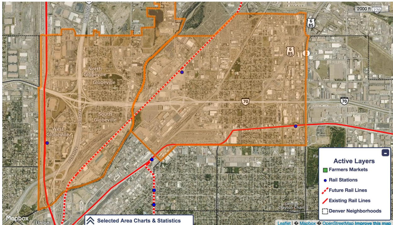
A map of the Globeville and Elyria-Swansea neighborhoods created using the Denver Regional Equity Atlas showing existing and future light rail stations as blue dots, and 2013 data revealing zero farmers markets in the area.

diabetes rates. In terms of potential solutions, no existing assessments demonstrate sufficient sales potential in GES to recruit a full-service supermarket to the area.