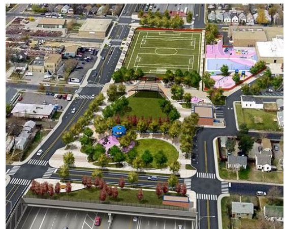
Rendering released in August 2016 shows the 4-acre cover planned over part of a lowered I-70.

Centrally situated in GES is one of the Denver region's most important historic, cultural, and agricultural resources - the National Western Center, which is in the process of being expanded and renovated in partnership with the National Western Stock Show, the city of Denver, and Colorado State University (CSU). The new site will be a 150-acre, year-round research, education, and cultural destination focused on agriculture, agribusiness, food security, and local food. Also impacting this region is a major highway improvement project being proposed by the Colorado Department of Transportation with federal funding that would take the aging, elevated I-70 highway that currently separates GES from downtown Denver, widening and replacing segments with at-grade and below-grade sections. Included in the current proposal is a multi-block cap over the below-grade section that would connect neighborhoods north and south of the highway. Renovation of the highway will impact a number of adjacent shops and houses, including some local stores that sell food. These major projects represent both challenges and opportunities for GES and the city of Denver to improve access to affordable, healthy food in the area.