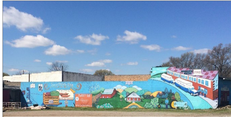
A mural highlights the agricultural economy of the region in downtown Martin, TN.

Martin and Dresden are two of five incorporated towns located in Weakley County, Tennessee. Dresden is the county seat, while Martin is the largest city and home to the University of Tennessee at Martin. Situated in the northwestern corner of Tennessee, the region boasts bountiful natural resources and productive farmland. As one of the state's leading agricultural producers, Weakley County was first known for