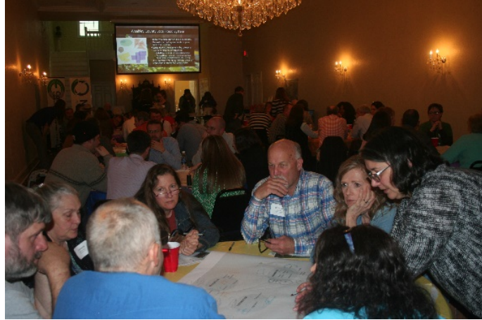
Day 1 evening workshop held at the Purple Iris in Dresden. Approximately 80 people attended the event.

The site visit was conducted over two days—March 21st and 22nd, 2016: a small lunch gathering at the Northwest Tennessee Entrepreneur Center office, community tours of Martin and Dresden, and an evening community meeting held at the Purple Iris event space in Dresden (Day 1) and a community workshop at the Northwest Tennessee Development District offices in Martin (Day 2). The community event and workshop were well attended by key stakeholder groups, residents, and local leaders (attendance list in Appendix C). The Local Food Network published the first Weakley County Local Food Guide just prior to the LFLP workshop, with the public meeting on the first day serving as the official launch of this important effort. This public meeting was the first in a planned series of community forums called “Using Food to Build Community,” providing an ongoing platform for Weakley County residents to gather and discuss issues and opportunities around strengthening the local food system.