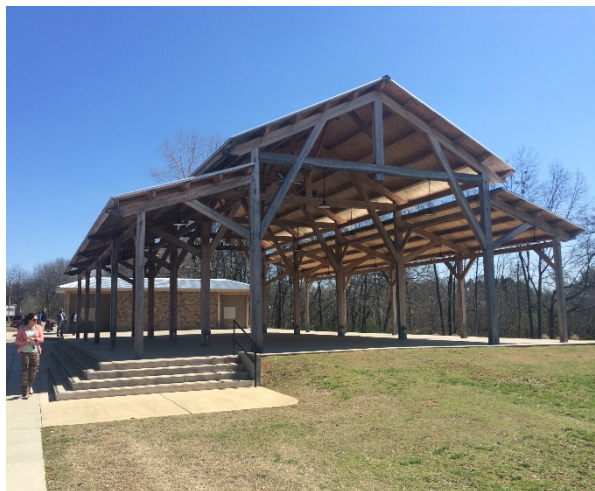
Top: City of Martin Farmers Market pavilion located in the historic downtown; Bottom: City of Dresden Farmers Market pavilion located just outside of downtown adjacent to the Green Rail Trail.