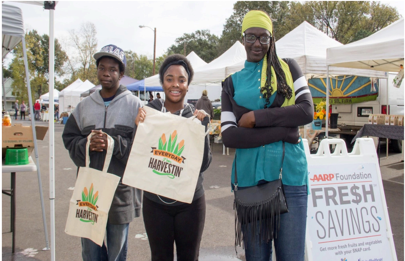
Photo: Youth volunteers help out at the Cooper-Young Community Farmers Market.

In the first workshop session, participants created models of their visions for an ideal farmers market using found objects. Participants in the workshop envision a future Cooper-Young Community Farmers Market with the following elements: