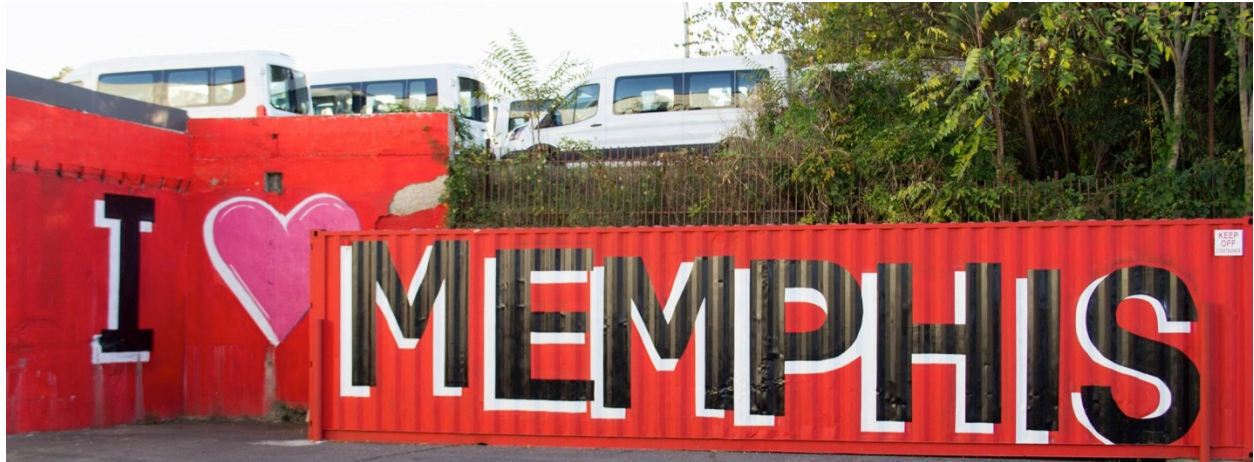
Photo: I Love Memphis mural in the Cooper-Young Neighborhood.