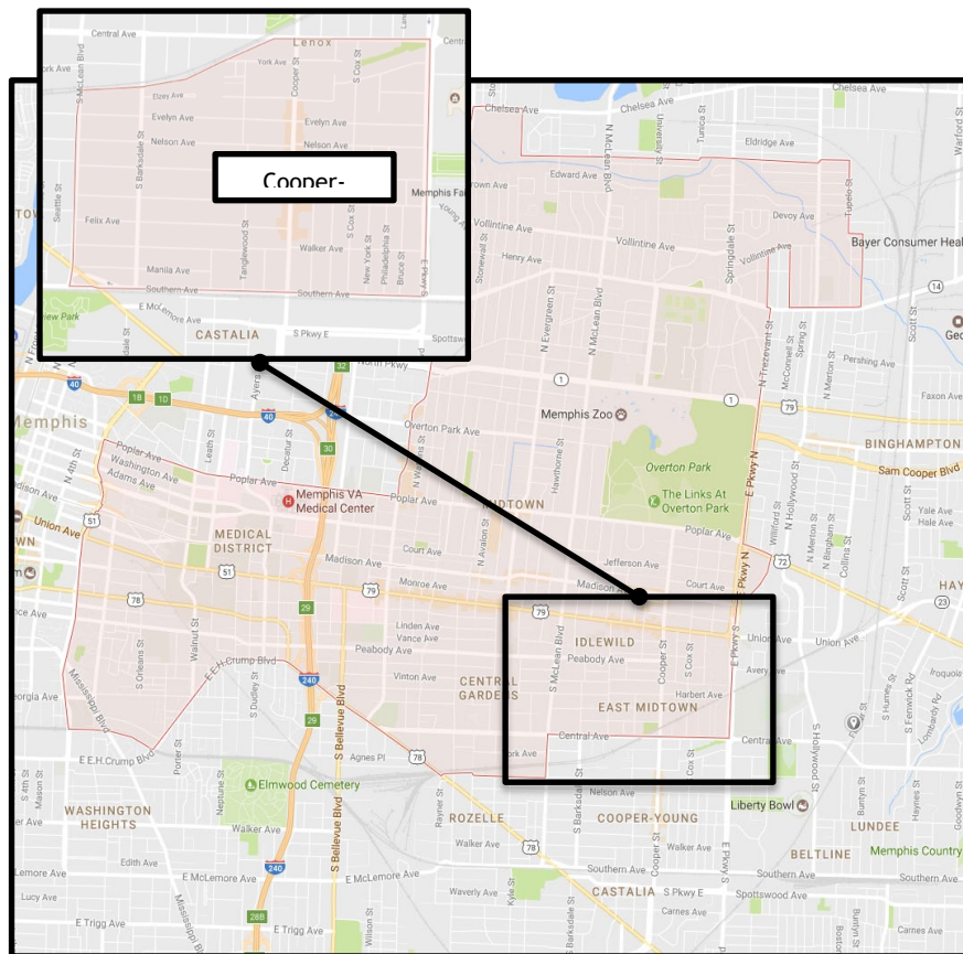
Figure 1: Google Map of Midtown Memphis. Cooper-Young (inset, enlarged) lies just to the south of the Midtown district.

Memphis is a regional transportation hub, with a major highway access point, barge traffic on the Mississippi, an airport, and rail lines. Memphis is also known as a diverse city with high rates of poverty (27.4%), though poverty is concentrated in distinct neighborhoods. Memphis's median household income is less than 70% of that for the United States as a whole. 1