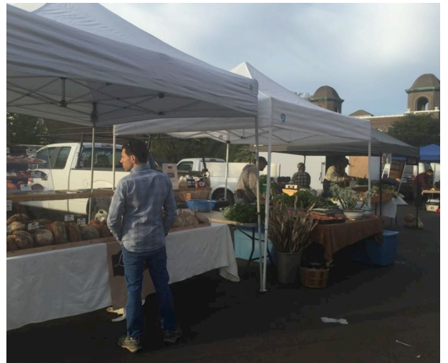
Photos: The CYCFM opens early Saturday morning.