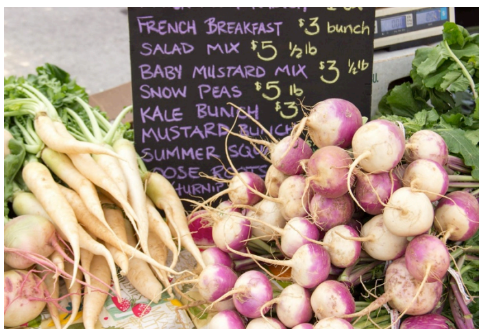
Photo: Produce for sale at the CYCFM.

Access is a major barrier to local and healthy food development in Memphis, in several respects. Public transit, bike and pedestrian infrastructure and transportation options are lacking for many Memphis neighborhoods, making it hard for residents to access many services and destinations in the city.