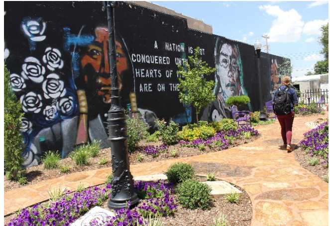
Figure 1 – A new “pocket park” in downtown Anadarko highlights recent proactive efforts by the city to revitalize downtown, making it more attractive to downtown patrons and prospective businesses. The adjacent space next to the park potentially supports a mobile farmers market or other temporary vendors.

Since that day in 1901, agriculture has been a mainstay of Anadarko’s economy. Corn and cotton were the staples for most of the 20 th century, but by the 1950s, peanuts, wheat, and alfalfa had become the major crops. Today, wheat dominates agricultural activity in