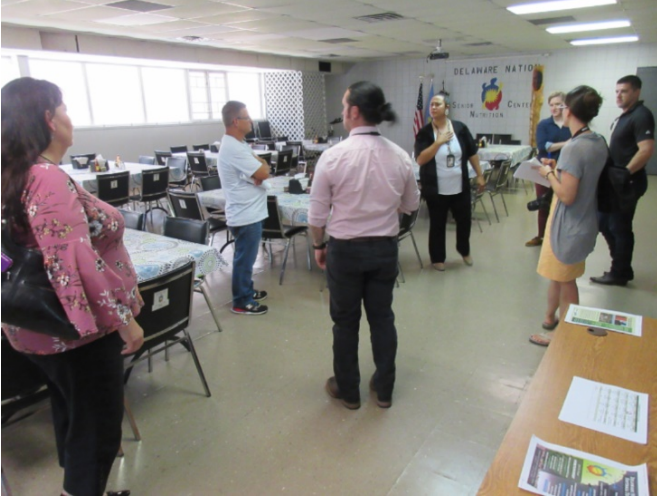
Figure 8 – The Delaware Nation Senior Center cafeteria offers healthy food options for tribal elders.