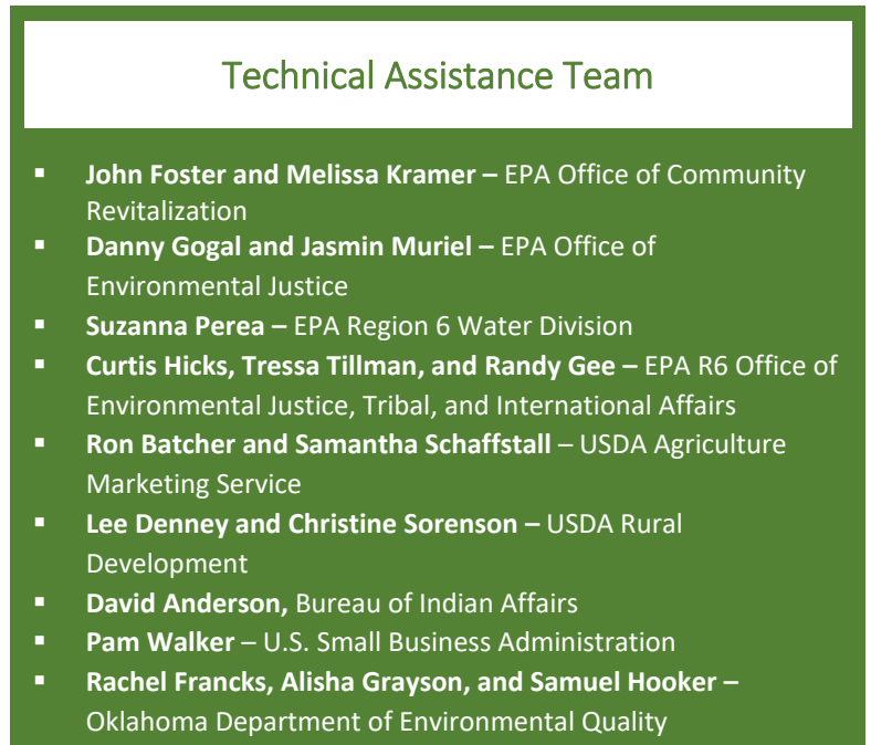
Figure 4 – Technical Assistance Team