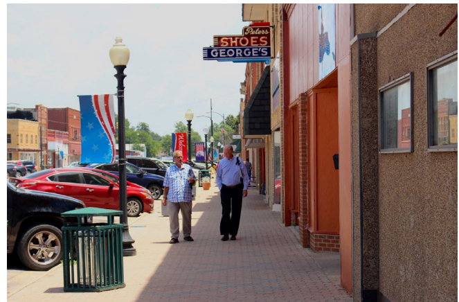
Figure 2 – Downtown faces economic challenges, with some vacant storefronts and empty lots, but overall retail activity remains strong, and downtown provides many amenities to local residents and visitors.