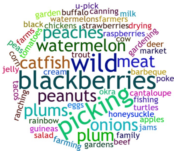
Figure 12 – As workshop participants introduced themselves, they shared a favorite memory of enjoying a local food. This word cloud of responses shows key words from the responses, with the size of the word indicating the frequency it was mentioned.