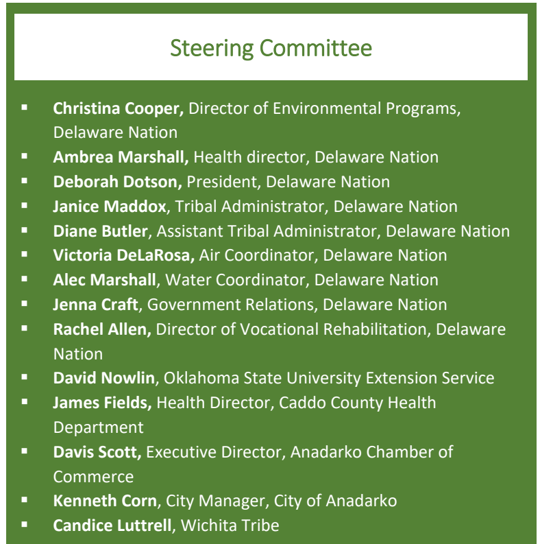
Figure 3 – Steering Committee Members

The technical assistance engagement process for Local Foods, Local Places has three phases, illustrated in Figure 5 below. The plan phase consists of three preparation conference calls with the steering