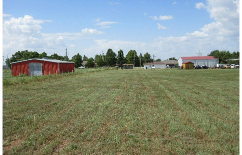
Figure 9 – The proposed permanent farmers market location sits just south of the buildings in the photo, along Petree Road.

highlighted how many Anadarko residents share close geographic proximity but vastly different experiences within the community. Often, communities seek to create a common community-wide vision to build the support needed for achieving many community goals and projects, but that is challenging in Anadarko given the multi-jurisdictional, cultural, and demographic differences that exist.