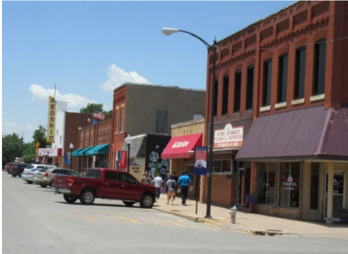
Figure 6 – Tour participants walking along West Broadway Street downtown.