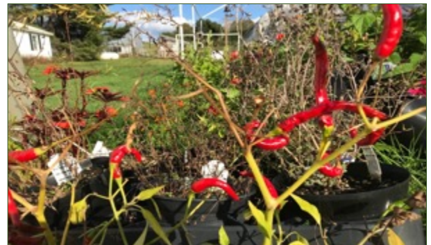
Figure 11 – Nature Works in Homer City is a small, diversified farm and nursery business helping to grow the local food system in Indiana County.

From the school and park, the group continued by car to briefly visit the Indiana Community Garden in privately owned Mack Park. The garden was created in 2012 and has 24 plots available to rent for $30 a year. Volunteers share the harvest from 12 larger community plots and many in-ground growing areas with local food banks and other members of the community. The garden sponsors a youth garden program, hosts or partners with numerous educational and community events, and provides numerous opportunities for service learning. Since the garden relies on volunteers, its recognition as a valuable community asset is important to attracting interested parties to help sponsor and maintain it for the future.