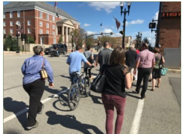
Figure 7 – The Borough of Indiana has completed numerous streetscape upgrades in recent years.