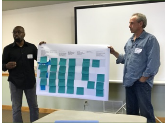
Figure 16 – At the end of the workshop, participants reconvene from smaller goal groups to report back on the priority actions identified and strategies for how to move forward over the next 12-24 months.

the points discussed were the preservation of cross walks following road and streetlight construction and addition of pathways between student housing centers and downtown. In another group, participants huddled around a generic food system diagram and identified partnerships and programs that currently exist in support of the local food system and others that the community would like to see reinvigorated or formed.