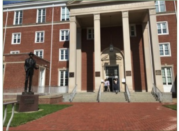
Figure 1 – The Indiana County Courthouse is flanked by a statue of actor Jimmy Stewart, who was born in the Borough of Indiana.

In the mid-twentieth century and in line with the post-war trends of the nation, coal mining in the region began a decline, as did manufacturing by the 1980s. The impacts of job loss from previously dominant industries continue to resonate as the area loses population, and the poverty rate has doubled since 2001 to its current rate of 20 percent. In 2017, the county's population was estimated at 84,953, 4.4 percent lower than the 2010 census, and income sits at $45,118, approximately 20 percent lower than the state and national averages. 5,6,7