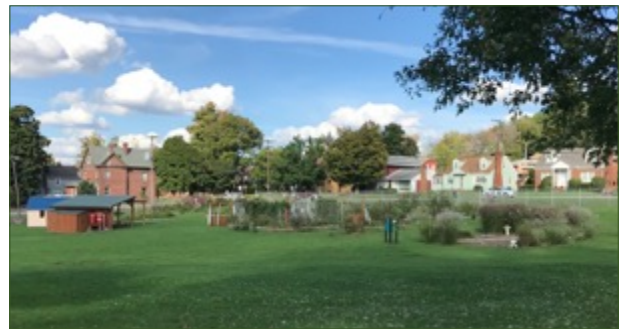
Figure 10 – The Indiana Community Garden is currently one of a kind in Indiana.

From the Food Co-op, the group continued on foot to Horace Mann Elementary School and finally Memorial Park, a county park punctuated by WalkWorks signs encouraging people to get moving with others. The walk provided the opportunity to see downtown streetscape renovations completed two years ago between 10 th and 5 th streets. Bricked sidewalks, energy-efficient lighting, and tree plantings are some of the upgrades made to the municipality's infrastructure. The construction did impact some local businesses though, and a number of retail spaces are vacant awaiting new tenants. At the Horace Mann Elementary School, part of the Indiana Area School District, the group paused to discuss the advantages of students being able to walk to school. Local stakeholders would like to see more greenery and shade added to the school grounds and ideally some gardens to complement students' classroom learning.