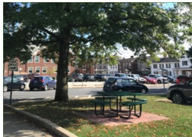
Figure 8 – A seasonal outdoor farmers market is held in a downtown Indiana parking lot on Saturdays.