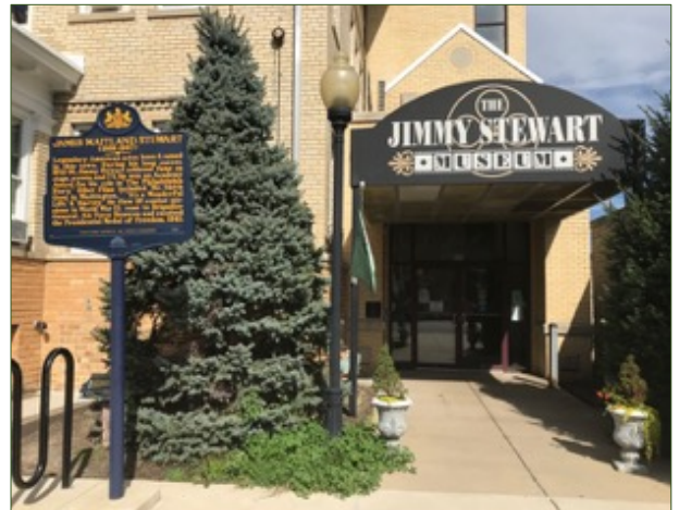
Figure 2 – The Jimmy Stewart Museum is located within the Indiana County Community Building at the intersection of 9 th and Philadelphia Streets in downtown Indiana.