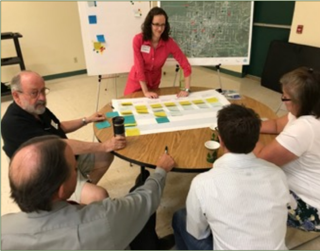
Figure 15 – Participants at the Indiana Local Foods, Local Places workshop discuss priority actions for one of the community’s goals and what efforts could advance it.