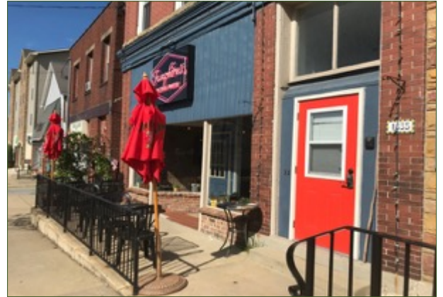
Figure 6 – The community tour started at Josephine’s Pizzeria and Enoteca, a third-generation family business that supports local agriculture.