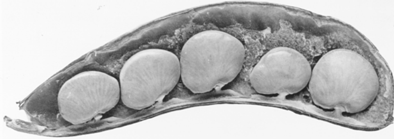
Well filled, well developed.