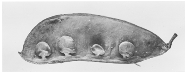
Cull – beans poorly developed

Lima Beans, Photo No. 2 July 1990 (Previously No. 2, no date)