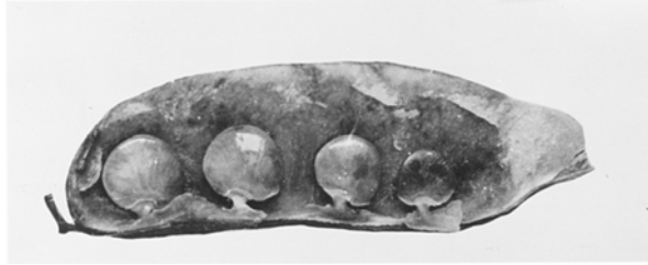
Not fairly well developed but more than equivalent to Pod one-third filled with fairly well developed beans.