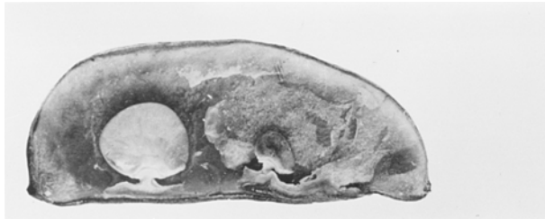
Fairly well developed and at least one-third filled with fairly well developed beans.