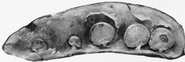
Fairly well filled, fairly well developed.