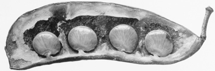
Well filled, border fairly well developed.