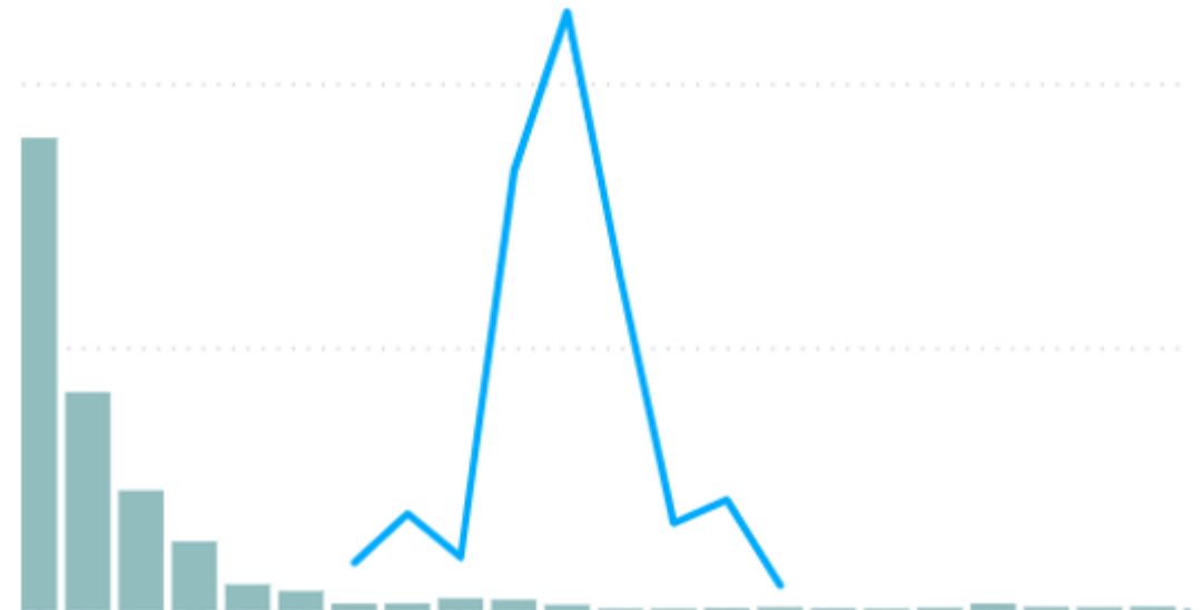
5R Price Distribution vs. MPR Distribution