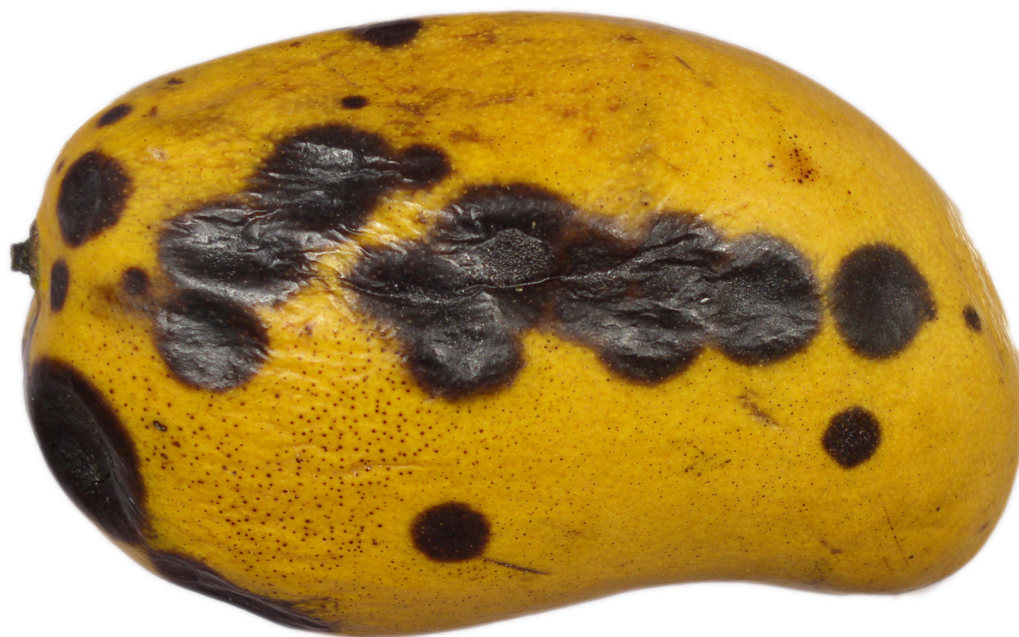
Anthracnose in advanced stages (along central portion of fruit).