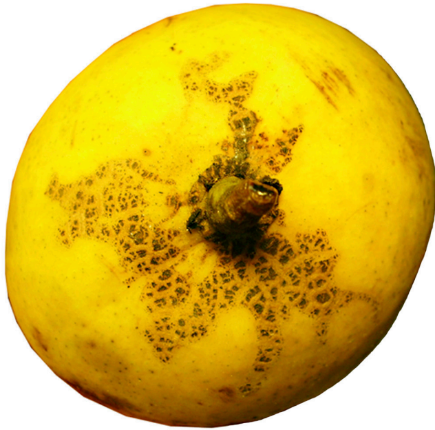
Scab on stem end of fruit.