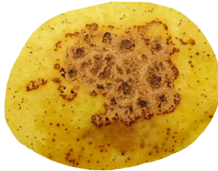
Scab of side of fruit.