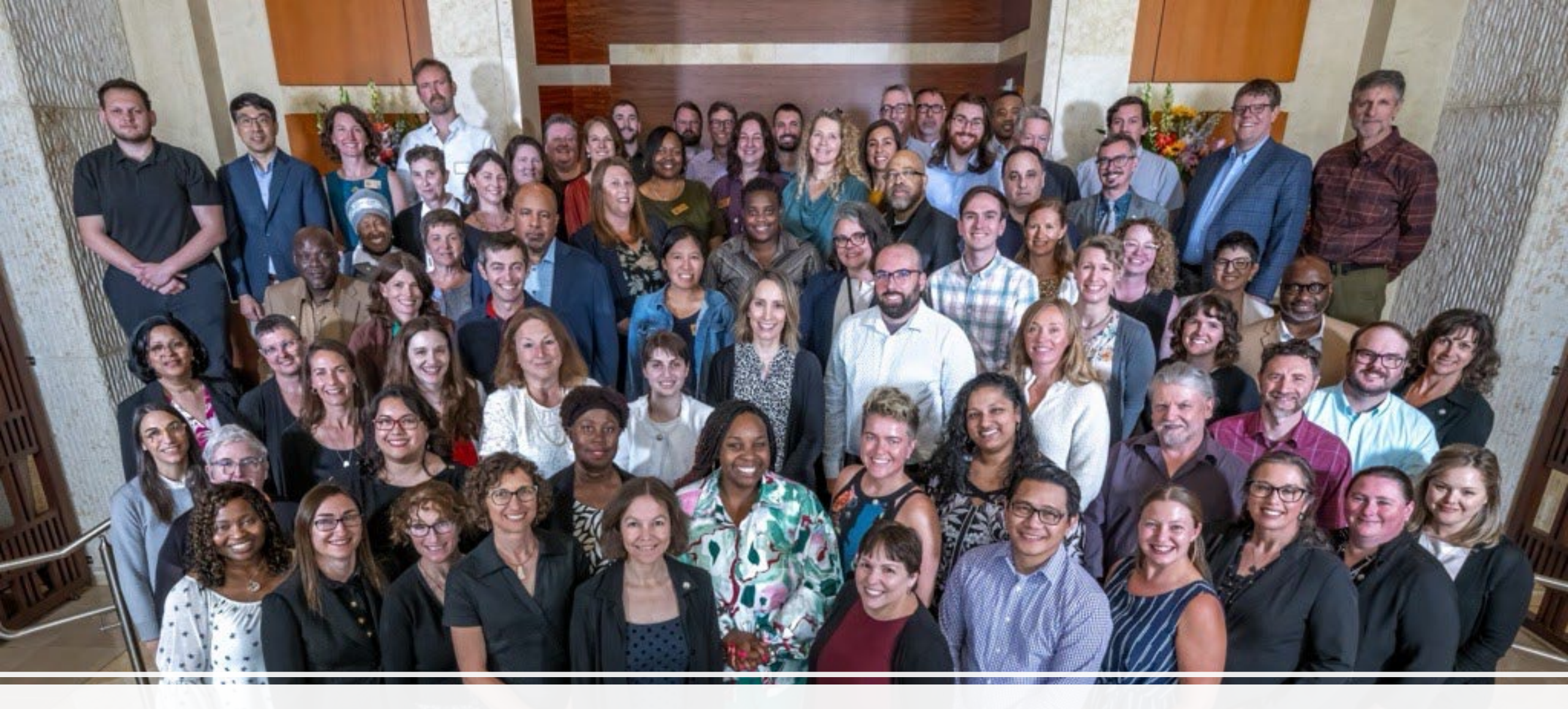
Team NOP - June 2024