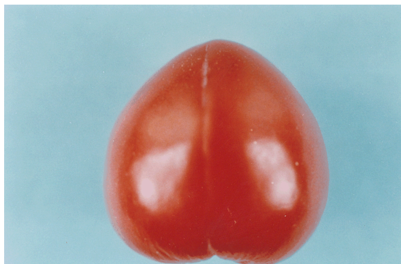
Red Beaut – Typical Shape