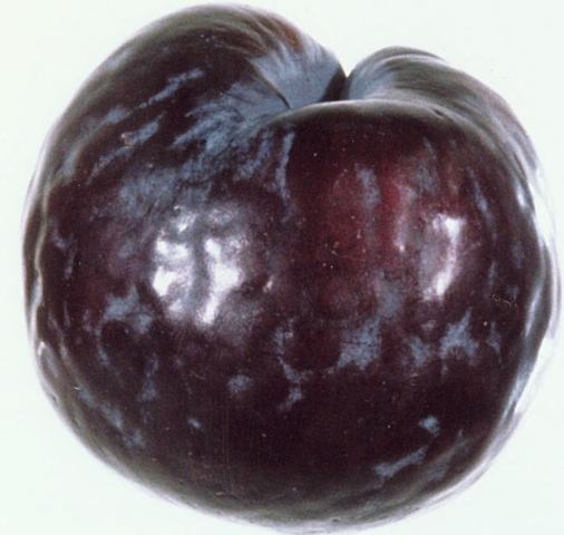
U.S. No. 1 Maximum Allowed

En Route or At Destination, score pebbling as a condition factor.