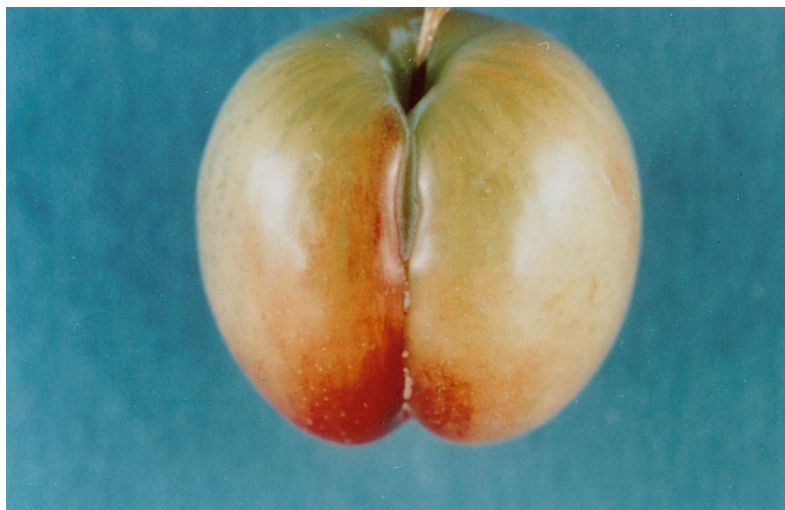
Santa Rosa Off-Shape Account Poor Pollinization