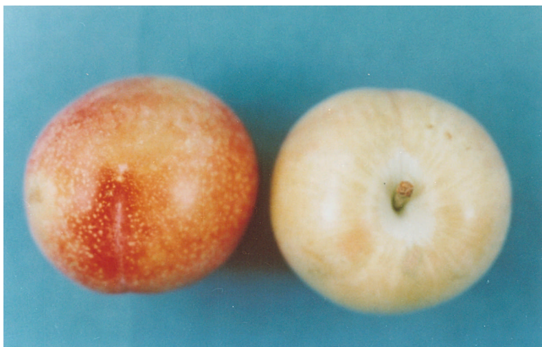
Santa Rosa – Typical Shape – End View