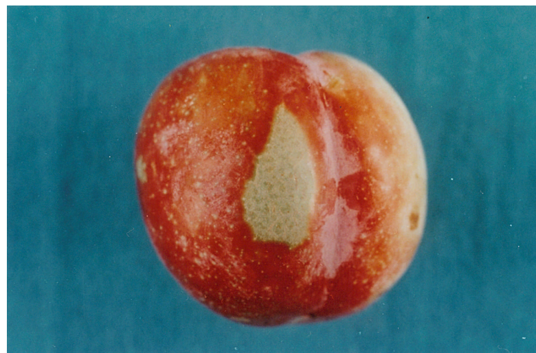
Santa Rosa Very Off-Shape Account Poor Pollinization