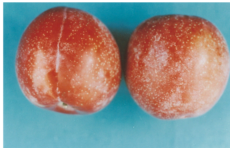
Santa Rosa – Typical Shape – Side View