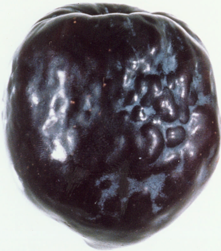
Serious Damage By Pebbling