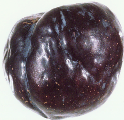
Damage by Pebbling (ignore shape)