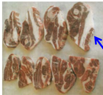
Rib bones and sternum