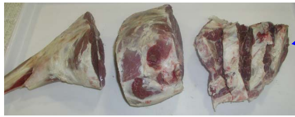
Sirloin portion ('notched cut')