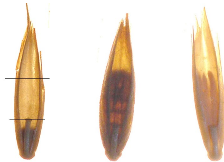
Left: Floret with endosperm that is less than one third the length of the palea. Center: Floret with sufficient endosperm. Right: Floret with flower parts and lacking endosperm.

such as Festuca and Lolium species, they must contain an endosperm that is at least one third the length of the palea. If it is smaller than that, it is not considered pure seed. Florets containing flower parts are considered inert matter and not pure seed. Identifying flower parts can be difficult because they look very similar to endosperm when examined over light, but there are a few identifying characteristics. Flower parts include stamens that look like fingers or prongs broken up vertically. They also easily break up when gently poked with forceps, whereas an endosperm will remain firm. Knowing how to identify the differences between flower parts and sufficient endosperm is crucial for getting accurate purity test results.