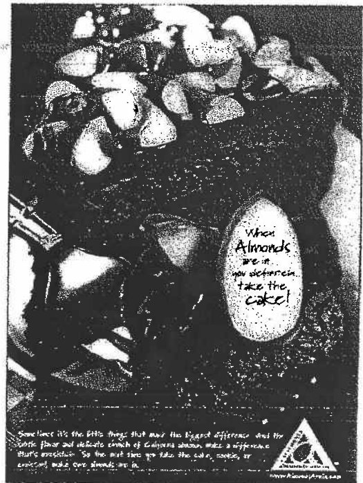
Advertisements like this stimulate demand for almonds.

The numbers in parentheses below each estimated coefficient are t statistics. A t statistic measures the degree