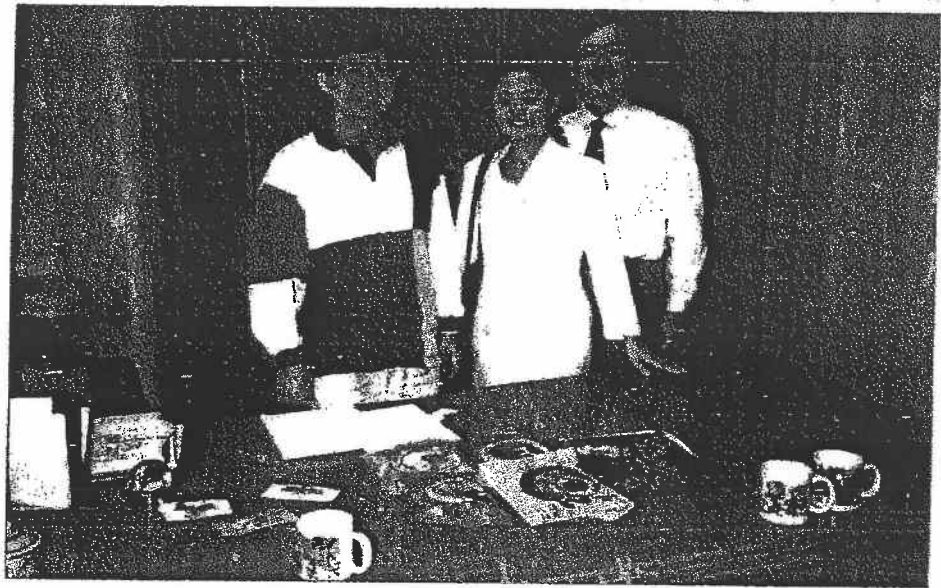
Although most advertising is directed to U.S. consumers, about two-thirds of California's almond crop is exported each year.

Table 1 reports the marginal benefit-cost ratios for almond promotion from 1990/91 through 1993/94 using the alternative values for the residual supply elasticity and the demand models for both the full data set (1962/63 through 1997/98) and the shorter time series (1980/81 through 1997/98). A real discount rate of 3% per year was used to compound the costs and benefits. All monetary calculations are deflated and expressed in 1998 dollars.