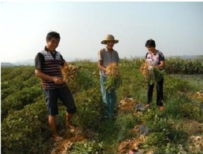
Shandong province producers show off their harvest bounty of peanuts.