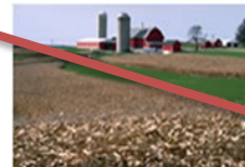
Accreditation and Certification

Organic production is a system that is managed in accordance with the Organic Foods Production Act (OFPA) of 1990 (PDF) and regulations in Title 7, Part 205 of the Code of Federal Regulations to respond to site-specific conditions by integrating cultural, biological, and mechanical practices that foster cycling of resources, promote ecological balance, and conserve biodiversity. The National Organic Program (NOP) develops, implements, and administers national production, handling, and labeling standards.