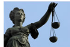
Compliance and Enforcement