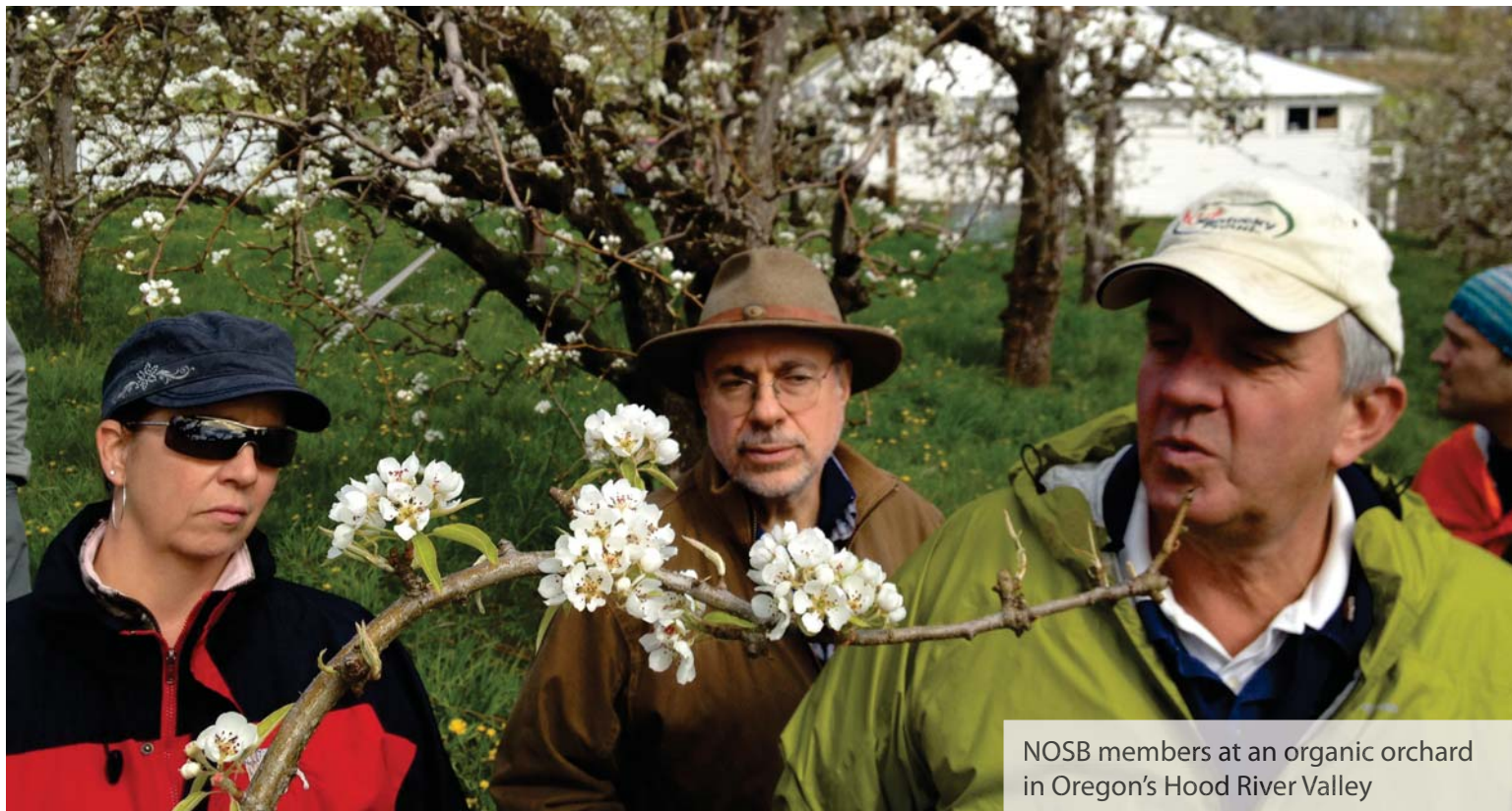
NOSB members at an organic orchard in Oregon's Hood River Valley